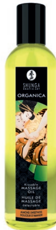
Guaranteed to be organic and good for you: massage oils from Shunga