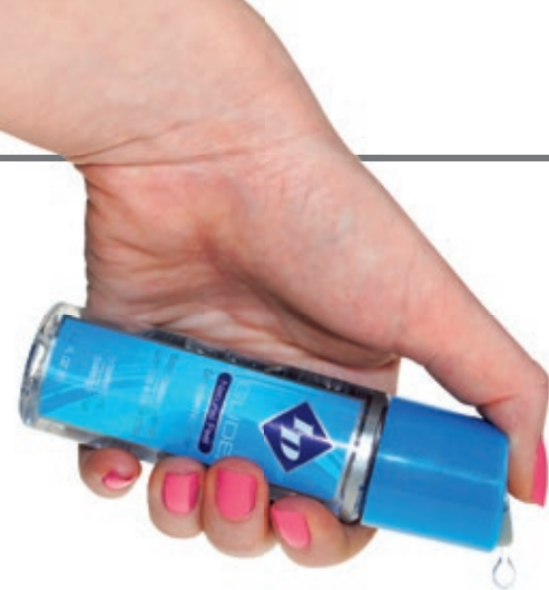
ID Lubricants – a flagship brand for quite some time

The spring and summer of 2015 has something for every taste and smell, and Creative Conceptions is placing a great deal of emphasis on consumer goods such as lubricants and massage accessories, for example with their brand ID Lubricants and products from Shunga Erotic Art, which are now available to customers via Creative Conceptions. Apart from the Coconut Divine Oral Pleasure Gloss and the new Organica massage oils Chocolate and Almond Sweetness from the Shunga brand, the British wholesaler also has Monoi in their assortment. "Monoi, the sensual massage oil, is ideal for giving or receiving a soothing massage intermingled with sensual caresses; this 100% natural oil with its intoxicating fragrance glides easily and smoothly over the skin without leaving any greasy residue. With the fresh smell of the